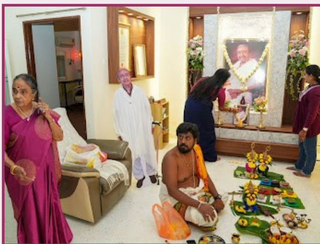
Prayers at Mother's residence