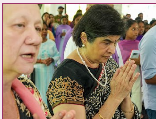
Prayers at the Temple of the Universal Spirit