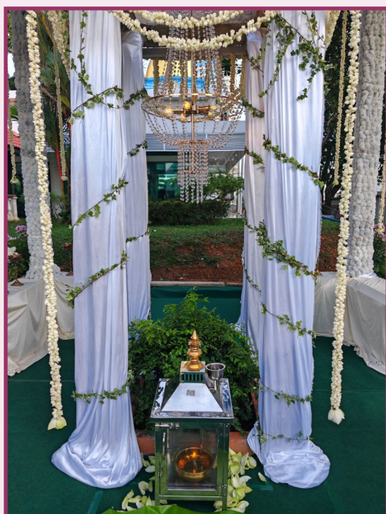
Mother Mangalam's Monument