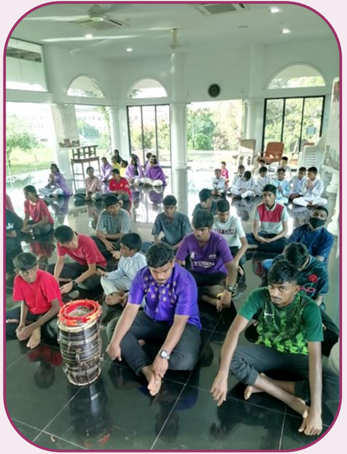
Prayers to usher in the New Year 2024 were held at the Temple of The Universal Spirit of The Pure Life Society. Children chanted universal prayers and made their resolutions for the year.