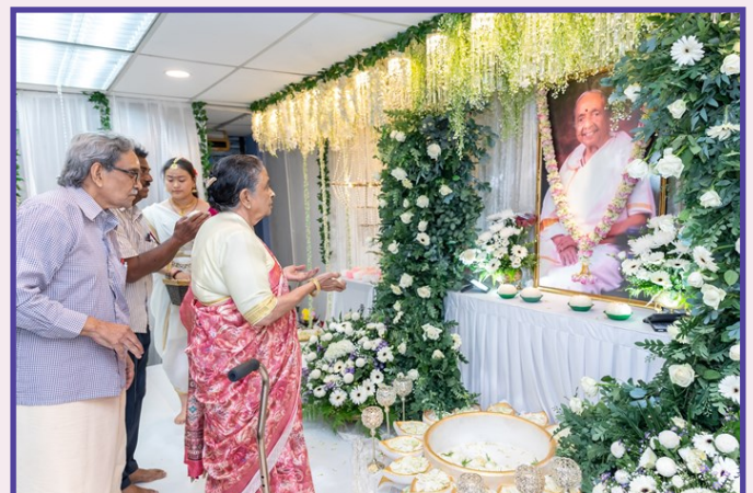
Offering of flowers by Guests